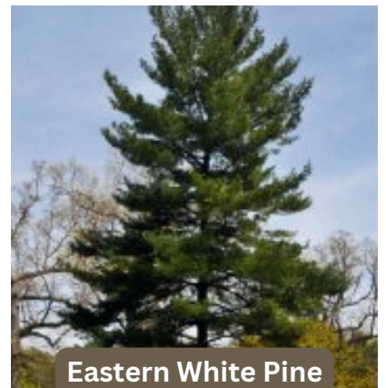
Eastern White Pine