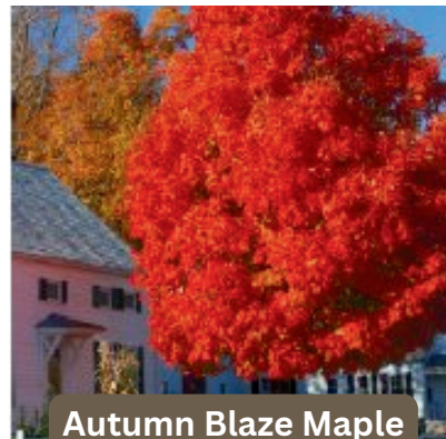
Autumn Blaze Maple

Plant a tree in memory of your loved one that comes with a customizable tree bracelet plaque for only $350! This is open to the public, learn more by visiting our website.