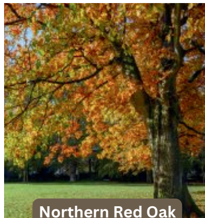
Northern Red Oak