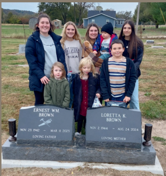
Family comes together together to remember their loved ones.

As a reminder, this was a discounted service that was offered to us last year. It has taken quite some time to complete but we are excited non the less!